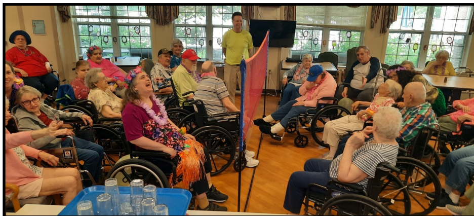
Top left: Beach Day Volleyball. Bottom left and right: Memorial Butterfly Service.