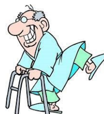
There's never a dull moment around here!!!

Here we are having some fun and memorable moments with our residents!!